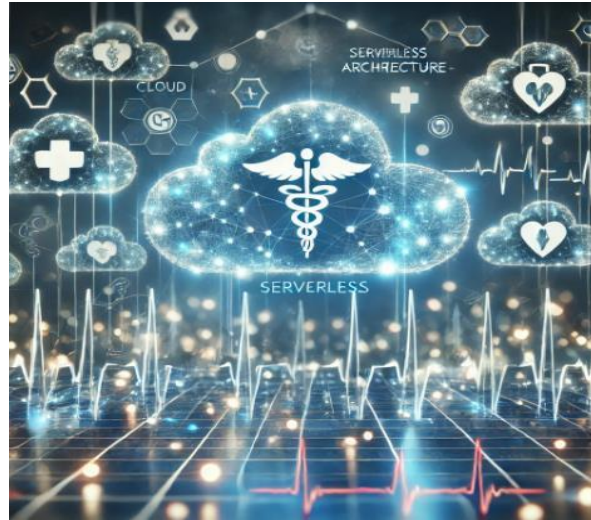
Figure 1: Serverless computing

improved patient outcomes. For instance, telemedicine applications can be developed to facilitate remote consultations, allowing patients to receive timely medical advice without the need to travel to a facility. In emergency situations, serverless applications can provide vital information to healthcare providers at the point of care, improving decision-making and patient safety. While the benefits of serverless computing are clear, it is essential to recognize that this paradigm shift also brings challenges. Transitioning to a serverless architecture requires a cultural shift within organizations. Developers and IT teams must adapt to new workflows and practices, which can be daunting. Furthermore, there may be concerns regarding data security and compliance, especially in a field as sensitive as healthcare. Organizations must ensure that their serverless applications meet the stringent regulatory requirements that govern patient data protection. Additionally, there is the issue of vendor lock-in. Many serverless solutions are tied to specific cloud providers, which can create challenges if an organization wishes to switch providers or move back to a traditional infrastructure.